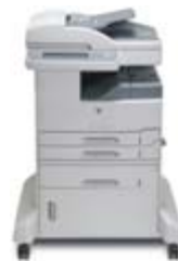
HP LaserJet M5035x MFP