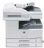
HP LaserJet M5035 MFP