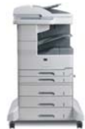
HP LaserJet M5035xs MFP