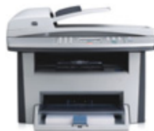
HP LaserJet 3052 AiO

Print, copy, and scan from one compact device